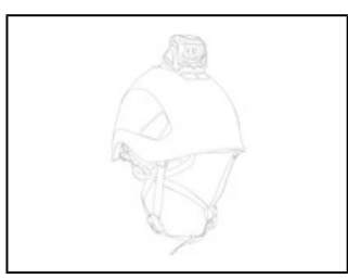
The adhesive plate can also be placed on top of the helmet, maintaining the ability to tilt the headlamp.

The HELMET ADAPT adhesive plate allows you to mount a compatible headlamp on most helmets.